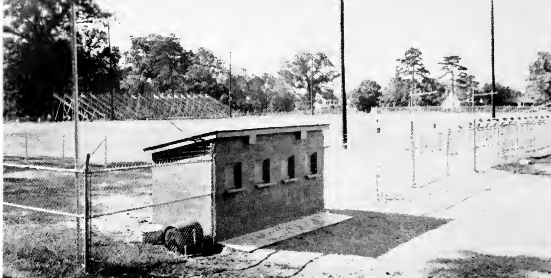
The new field with the bleachers next to the Woods incomplete. The houses seen in the background are on Court Street.